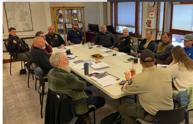
NRP's Public Safety Action Team plans for a safer Newberry

➤ Lead Partners: Sunriver Police Department, Deschutes County Sheriff's Office, Deschutes County Emergency Services, Deschutes County Road Department, Sunriver Resort, Sunriver Owners Association