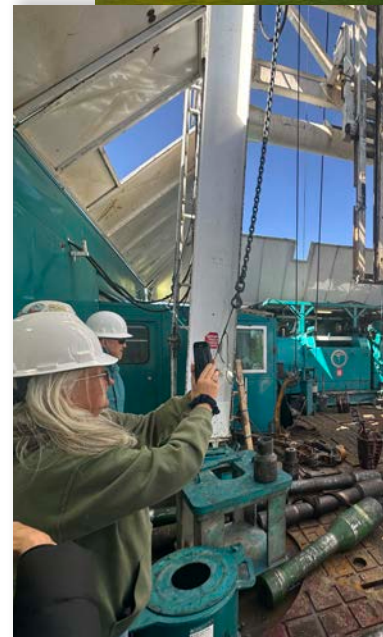
Enhanced Geothermal System Newberry Crater