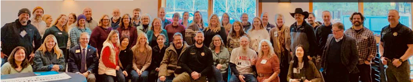
Newberry Country stakeholders celebrate at NRP's Action Summit, November 2024

Newberry Regional Partnership PO Box 3021, La Pine, Oregon 97739 541-771-2498 engage@newberryregionalpartnership.org www.newberryregionalpartnership.org