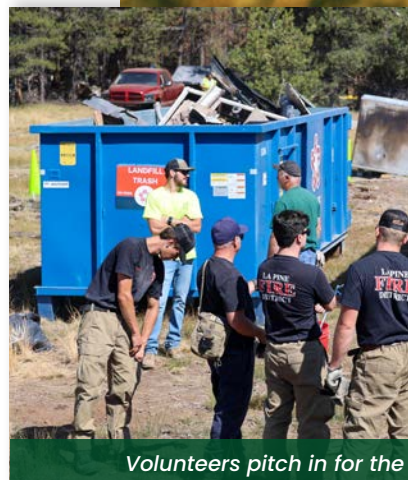
Volunteers pitch in for the

➤ Lead Partners: Republic Services, Deschutes County Solid Waste