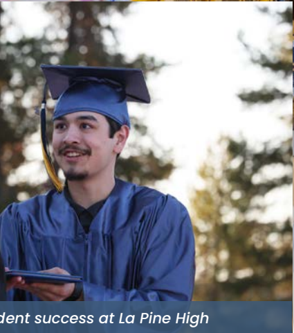
Student success at La Pine High

“ South County Collaborative is thrilled to be part of the effort to mobilize the ideas, energy and talents of Newberry County to help support our young people becoming more engaged with life. We are all about supporting their education, building personal resiliency, forging a sense of community, and allowing them to pursue their dreams.”