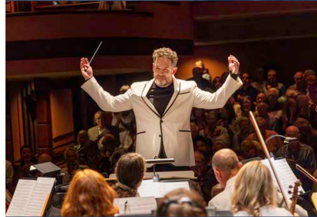
Sunriver Music Festival's world-class performances