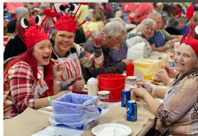
La Pine Frontier Days Annual Crab Feed

➤ Lead Partners: La Pine Historical Society & Museum, Deschutes Historical Museum, La Pine Urban Renewal